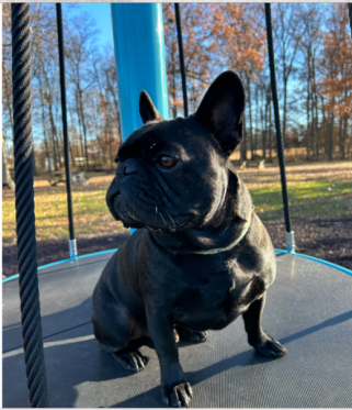
Jac (the Devine family's dog)

Ironically, there are more cats than dogs in the United States. The reason being, many cat owners own more than one cat!!