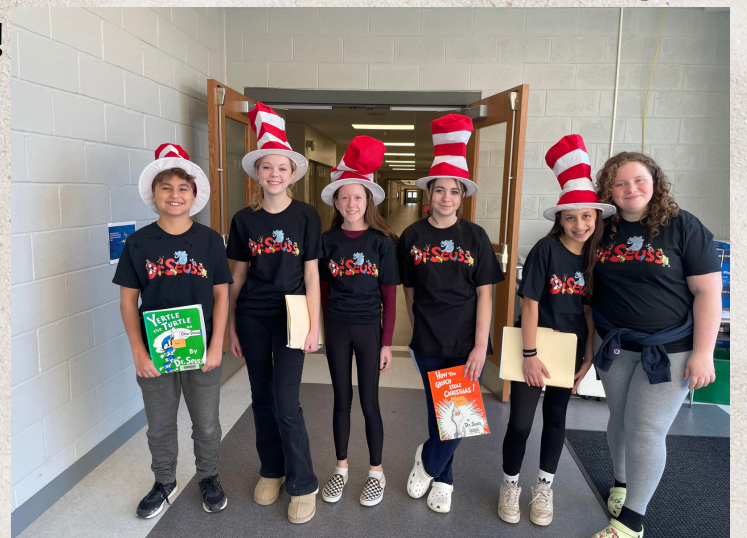
Some of the peer leaders before reading