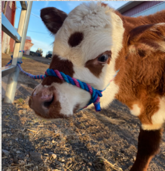
Ollie (the Lauber family's 5 month old calf)

So on February 20th be extra loving and kind to your pet, whichever it might be. Give extra treats, hugs, walks, and love whenever you can! And if you missed it this year, be on the lookout for National Love Your Pet Day next year! Here are some pictures of pets you may know.